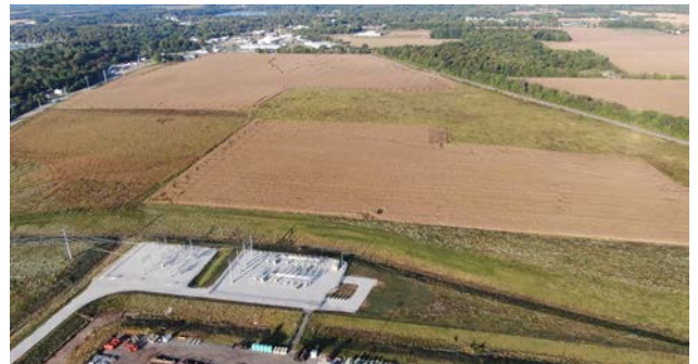
Aerial view looking WSW from Decatur Road – substation in foreground; M-60 Highway on left; CN Rail on right

Ideal, but not limited to agricultural, automotive, and metals manufacturing