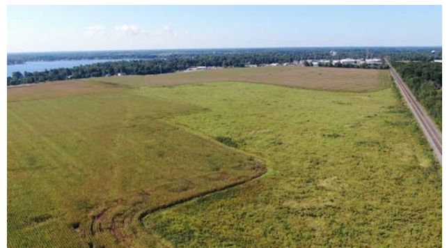
Aerial view looking SW towards Cassopolis - Diamond Lake on left and CN Rail on right