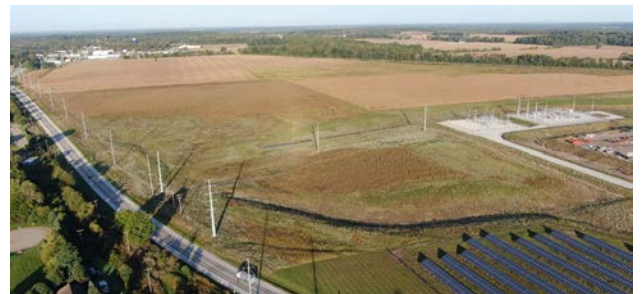
Aerial view looking NW from Decatur Road (south of M-60 Highway)